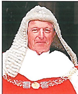
Lord Chief Justice, Lord Woolf

Jon Venables and Robert Thompson could be freed within months after the Lord Chief Justice, Lord Woolf, ruled the process of parole could begin immediately. His decision provokes stiff opposition from many people on Merseyside.