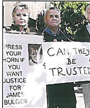
Protesters at the parole hearing

Protesters demonstrate outside the Parole Board headquarters in London against the expected decision to free the killers of James Bulger. Jon Venables' case was the first to be heard, taking place at a secret location.