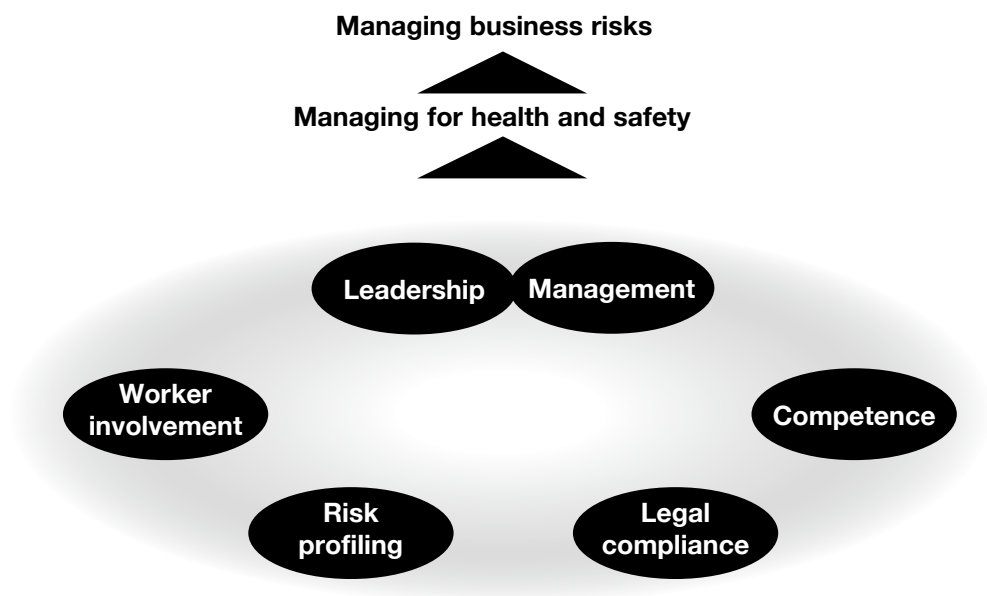
Figure 1 The core elements

HSE provides advice and templates on these processes – see our risk management site for more information ( www.hse.gov.uk/risk ).